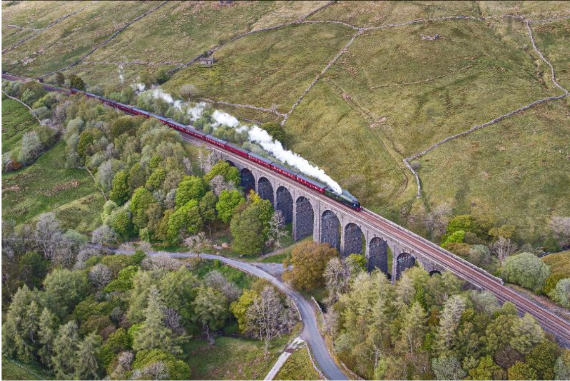
No. 60163 Tornado crossing the Dent Viaduct, hauling 'The Pennine Explorer' on May 22 nd 2021

Finally, after many months of waiting patiently at the National Railway Museum, York, No. 60163 Tornado was back in service on the main line. On Saturday 22 nd May, The A1 Steam Locomotive Trust ran 'The Pennine Explorer', after an early morning departure from Leicester, an hour and a half later Tornado was coupled to the train at Barrow Hill North Junction. Departing ahead of time meant some steady running north to join the East Coast Main Line (ECML) at Colton Junction and after a stop at York we were back on schedule. Despite some checks on the run north Tornado stretched her legs out a little up to the water stop at Tursdale Junction and then past Tyne Yard before taking the Tyne Valley Line west to Carlisle.