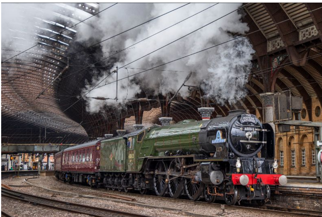
No. 60163 Tornado at York, hauling 'The Pennine Explorer' on 22 nd May 2021

60163 TORNADO New Steam for the Main Line