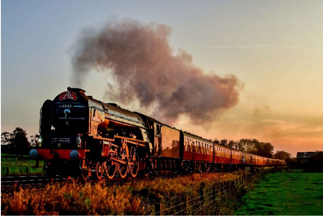
No. 60163 Tornado - In the evening light the train heads towards Blackburn, 19 th September 2020

In 2021 we will be starting our operating season earlier with two trains over the Valentine's Day weekend before making our first visit to the City of Hull and running to Aberdeen from Glasgow in a variation to our regular summer itinerary. A highlight for many will be Tornado and Flying Scotsman working together in September and demand is bound to be high for those trains. We are also visiting Liverpool, the Cumbrian Coast and of course our regular summer programme of 'The Aberdonian' from Edinburgh to Aberdeen.