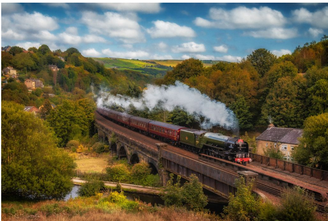
No. 60163 Tornado , at Calder Valley, hauling 'The Ticket to Ride' on 19 th September 2020

60163 TORNADO New Steam for the Main Line