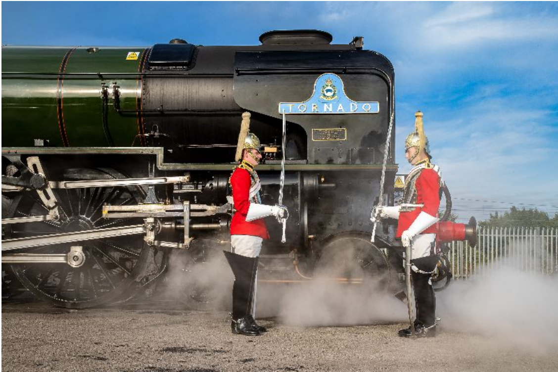
No. 60163 Tornado hosting the Household Cavalry Mounted Regiment at the National Railway Museum, York

As a small charity we value your continued support and are reviewing all our activities on a frequent basis to protect everyone involved with the Trust and to secure our long-term future. Please keep an eye on our website and Facebook pages for updates or call 01325 460163 or email enquiries@a1steam.com if you have any questions.