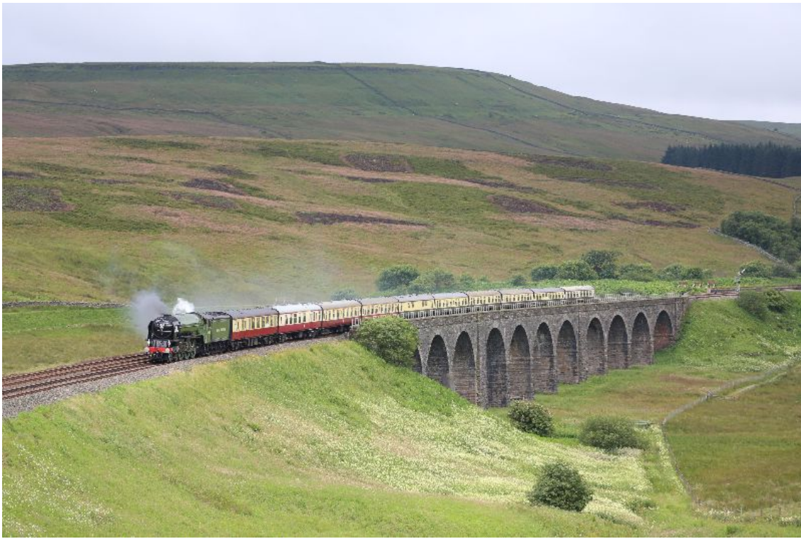
July 2019 - Tornado hauling 'The North Briton' across the Dandry Mire viaduct

Plans are well advanced for the return of steam tours and heritage railways in the UK. It's been a long enforced break!