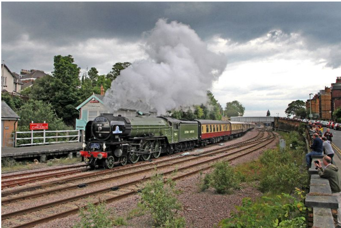
Tornado in Scarborough, June 2019, 'The Yorkshire Pullman'

With the easing of lockdown continuing we are currently planning our first railtours with Tornado in September 2020. In July, our team will be undertaking the necessary maintenance procedures and other work to ensure Tornado continues to be in tip-top condition for our return to traffic.