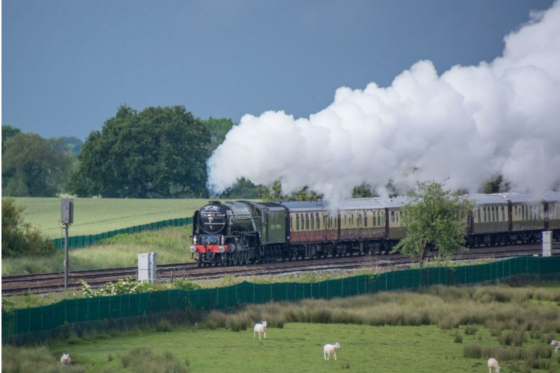
Last June, Tornado hauled 'The Yorkshire Pullman'

Also, contact shop@a1steam.com for details of smokebox number plates and headboards carried by Tornado - available to buy from just £200!