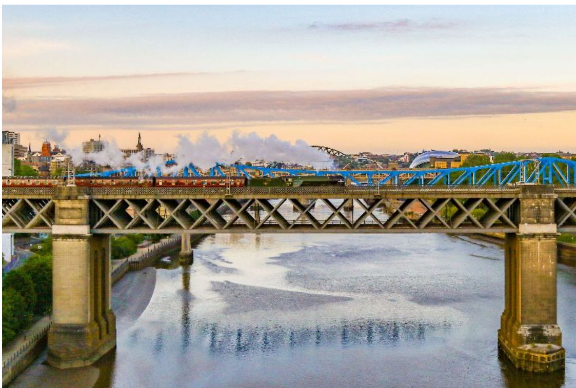
No. 60163 Tornado crossing the King Edward Bridge, Newcastle hauling 'The Edinburgh Flyer', on 19 th June 2021