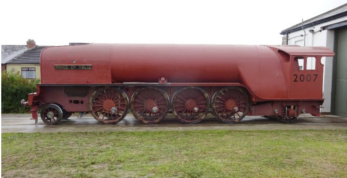
No. 2007 Prince of Wales at Darlington Locomotive Works

As a small charity we value your continued support and are reviewing all our activities on a frequent basis to protect everyone involved with the Trust and to secure our long-term future. Please keep an eye on our website and Facebook pages for updates or call 01325 460163 or email enquiries@a1steam.com if you have any questions.