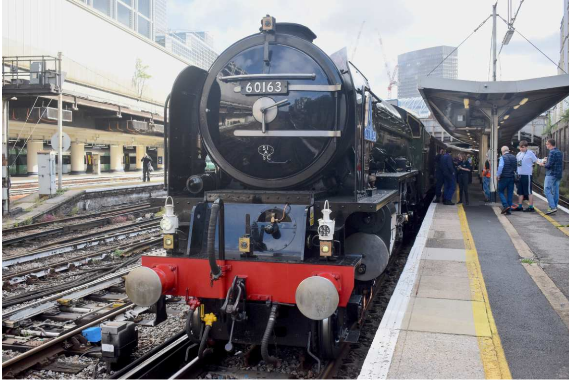
No. 60163 Tornado at London Victoria hauling 'The Northern Belle', on 5 th July 2021

On 19 th June, No. 60163 Tornado ran to Edinburgh from York in charge of the Railway Touring Company's 'Edinburgh Flyer'. The trip allowed some spectacular views along the Northumberland Coast north of Newcastle but it also allowed for some lively running and Tornado certainly stretched her legs with some spells in excess of 70mph. Good management by the crew ensured the outward journey kept well to time and despite leaving a well-managed water stop slightly ahead of schedule, signal checks at Grantshouse slowed the remainder of the northbound journey, recovering a little before arriving just a few minutes outside booked time into Edinburgh. The return journey ran well until Morpeth, where a landslip forced the move of the water stop back to Heaton. Some bi-directional running then added a delay of 12 minutes that could not be recovered and led to a delayed arrival back at York.