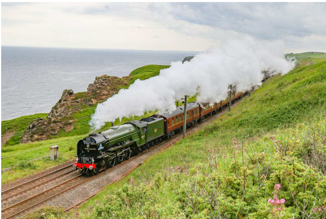
No. 60163 Tornado at Lambton hauling 'The Edinburgh Flyer', on 19 th June 2021

It has been a difficult year, with only very limited operation of Tornado due to the pandemic. The patience of all our passengers and supporters is much appreciated. We are now in a more positive situation with the locomotive recertified for the next 12 months of operation and a full programme ahead. There is nothing better than main line steam, especially with Tornado at the head of the train,