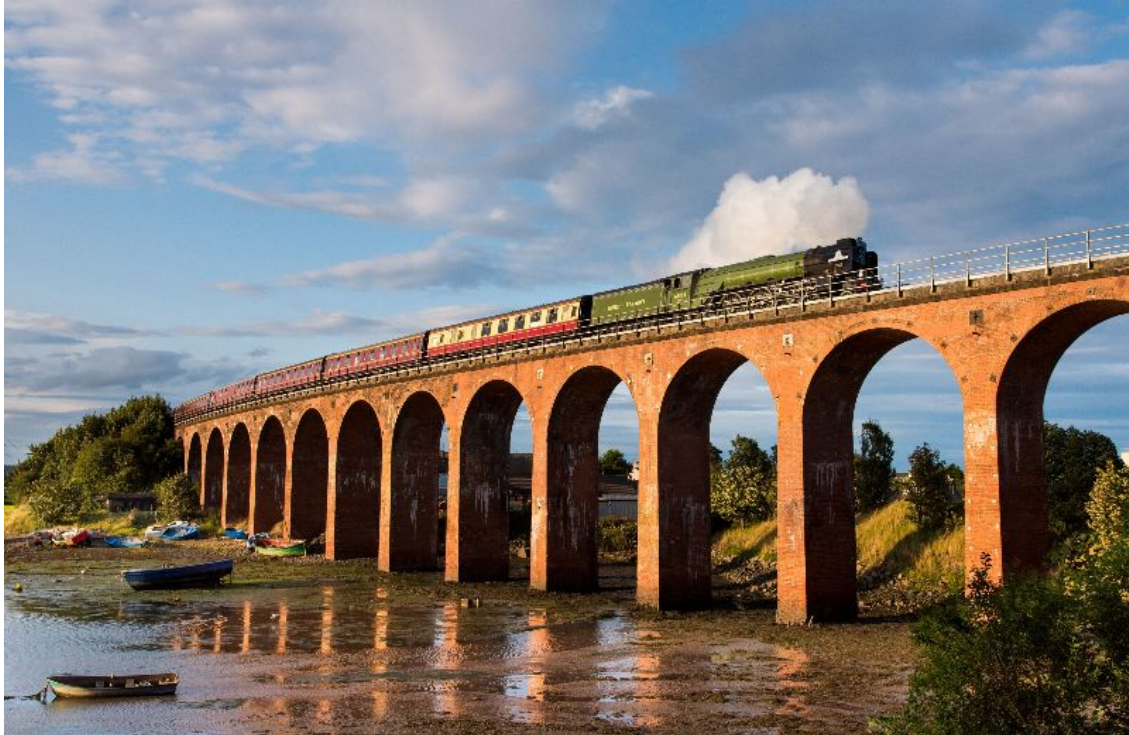
No. 60163 Tornado hauling 'The Aberdonian'

It has been a difficult year, with only very limited operation of Tornado due to the pandemic. The patience of all our passengers and supporters is much appreciated. We are now in a more positive situation with the locomotive recertified for the next 12 months of operation and a full programme ahead. We are working hard to redate those trains affected by lockdown, and we have already got several confirmed. There is nothing better than main line steam, especially with Tornado at the head of the train, so please have a look at the diary below and we look forward to welcoming you on-board.