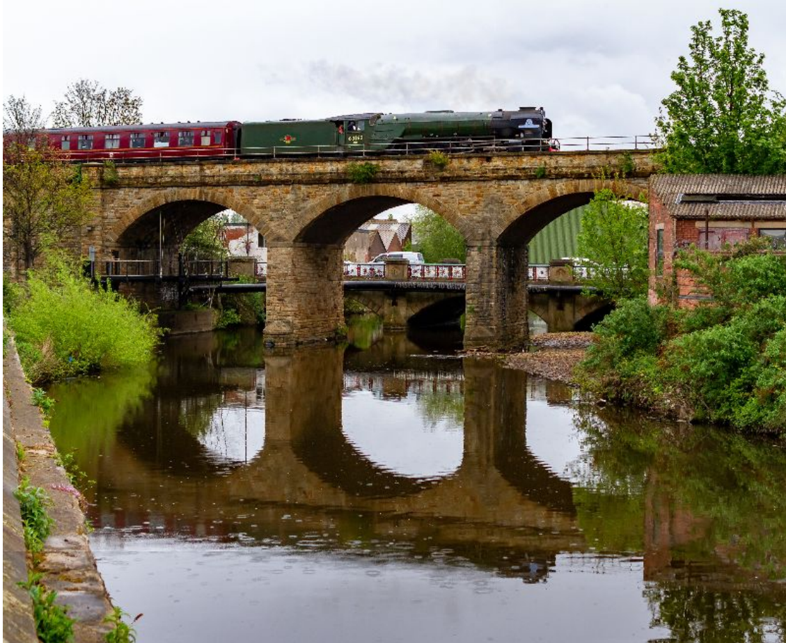
No. 60163 Tornado en route to Barrow Hill on 11 th May 2021 - Alan Weaver/A1SLT