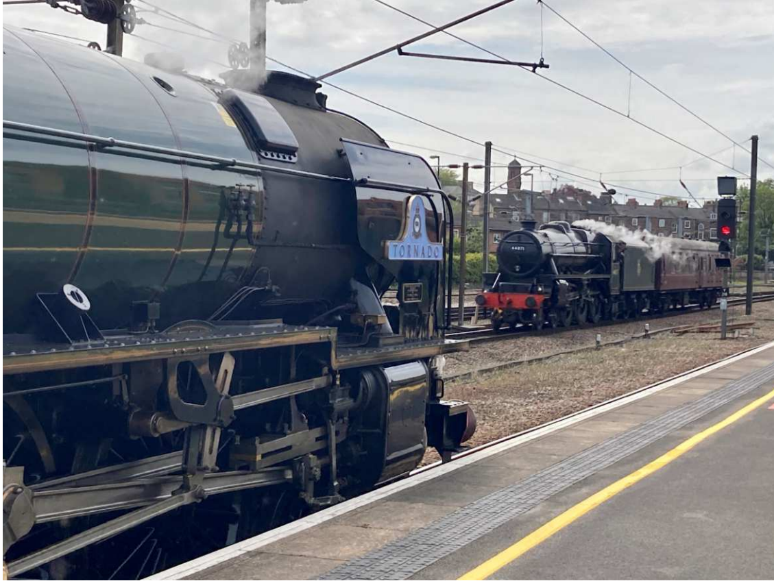
No. 60163 Tornado and Black 5 No. 44871, York, 11 th May 2021 - A1SLT