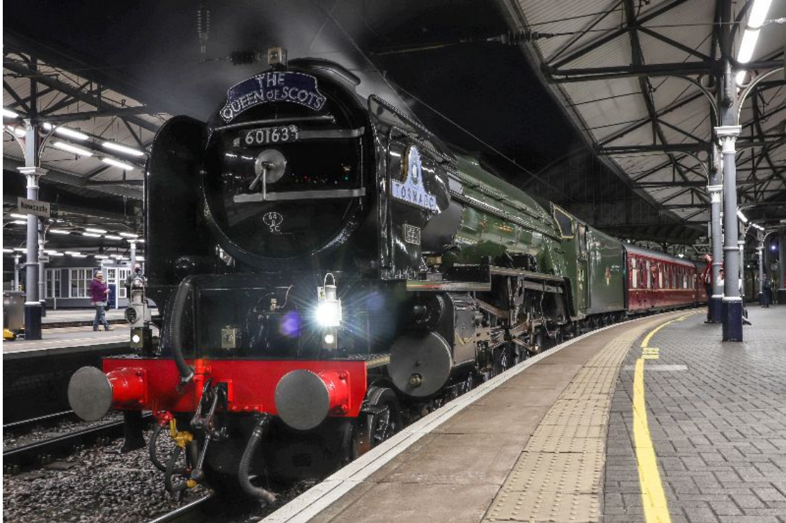
No. 60163 Tornado at Newcastle, heading back to York, on 12 th September 2020

After 'The Queen of Scots' tour, we found a broken spring on the rear driving axle which we are pleased to report was quickly changed by our full-time staff, supported by volunteers. It was indeed fortunate that this was found so close to home and a spare was quickly moved from Darlington to be fitted at York, enabling the locomotive to pass the FTR exam on the Friday before we took the 'The Ticket to Ride' to Liverpool from Darlington. Following the unfortunate cancellation of The Railway Touring Company's 'The Easterling' train on Saturday 3 rd October, our next booked turn is 'The Cheshireman' from Bristol to Chester on Saturday 14 th November. This will mean a light engine move from York to Bristol in the preceding week and in the meantime, we will take the opportunity for some routine maintenance before we leave York.