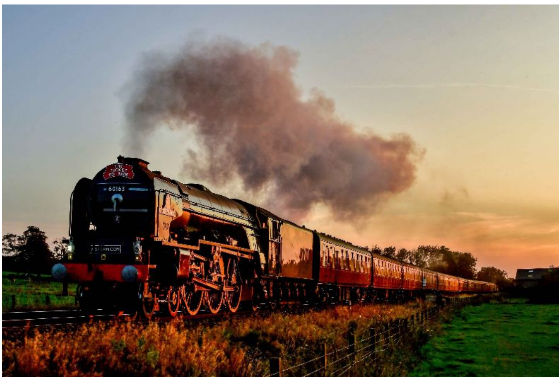
No. 60163 Tornado - In the evening light the train heads towards Blackburn, 19 th September 2020