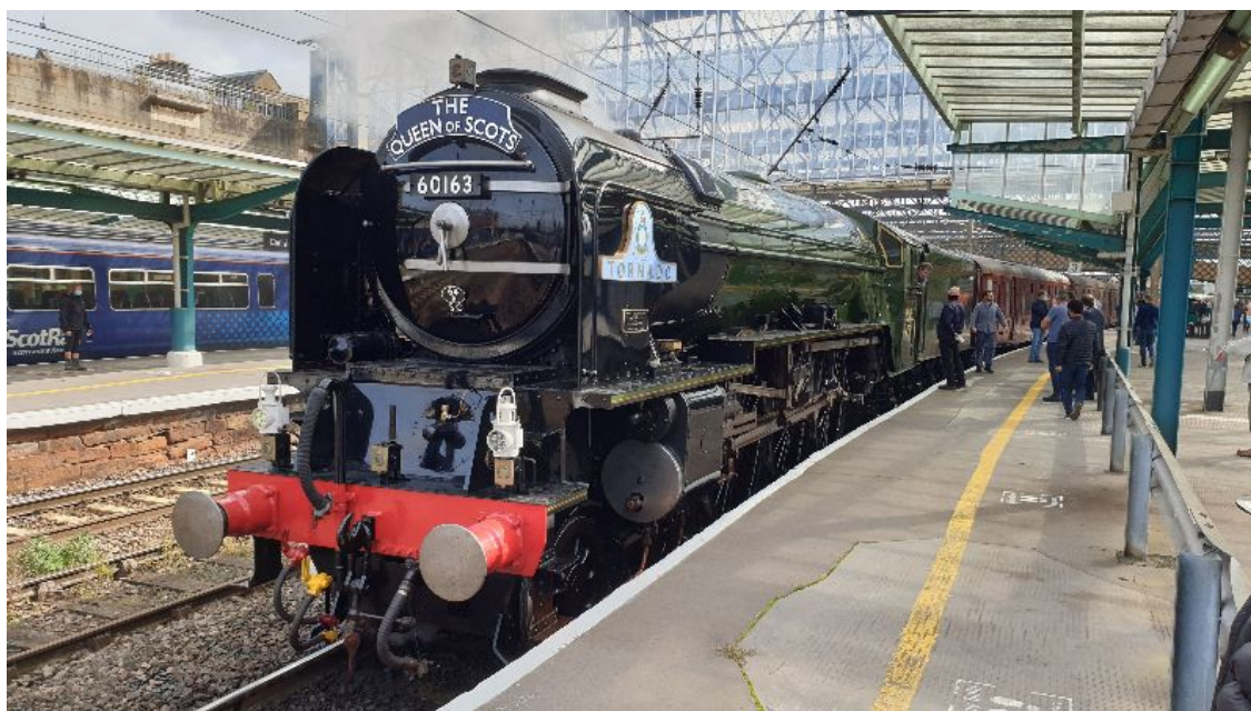
No. 60163 Tornado at Carlisle on 12 th September 2020

60163 TORNADO New Steam for the Main Line