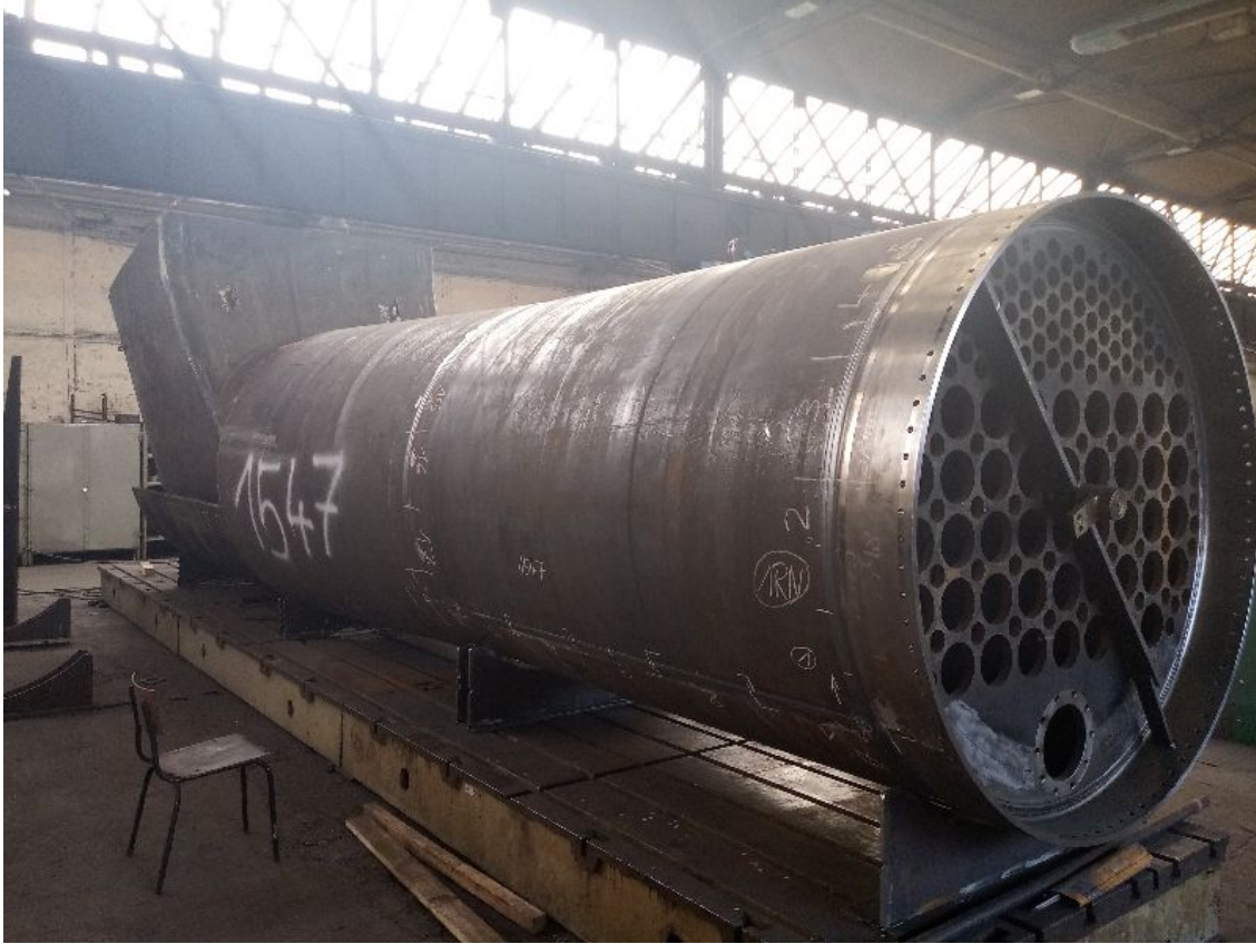
The first new boiler being assembled at DB Meiningen - DBM/A1SLT

Since last year's announcement of the placing of a £1m order for two new Diagram 118 boilers from DB Meiningen (DBM) significant progress has been made and assembly of the first boiler is underway.