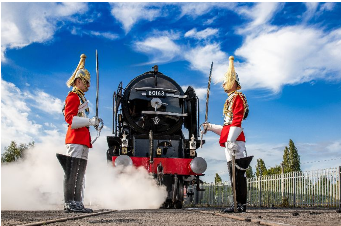
No. 60163 Tornado hosting the Household Cavalry Mounted Regiment at the National Railway Museum, York

As a small charity we value your continued support and are reviewing all our activities on a frequent basis to protect everyone involved with the Trust and to secure our long-term future. Please keep an eye on our website and Facebook pages for updates or call 01325 460163 or email enquiries@a1steam.com if you have any questions.