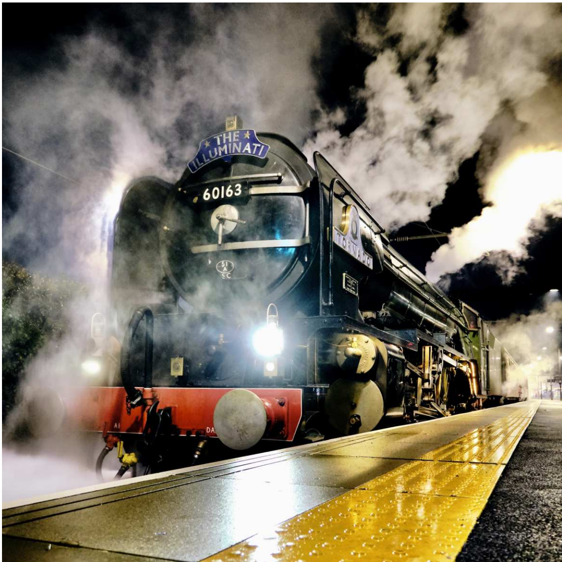
No. 60163 Tornado in Blackpool, hauling the 'The Illuminati'