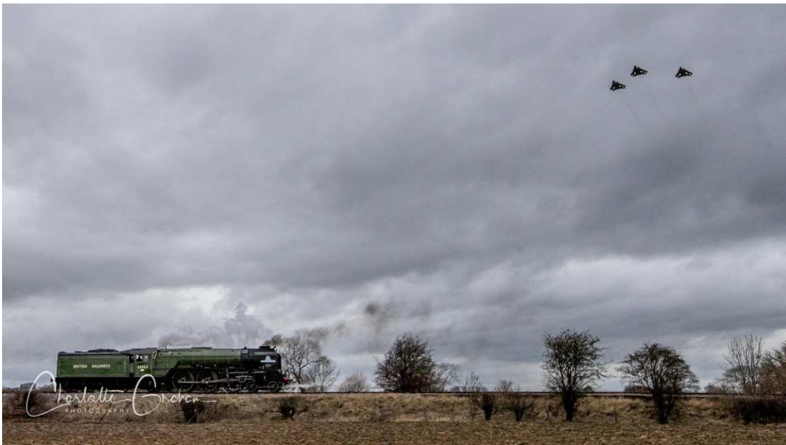
Tornado flypast over No. 60163 Tornado , 19 th February 2019, at Wensleydale Railway