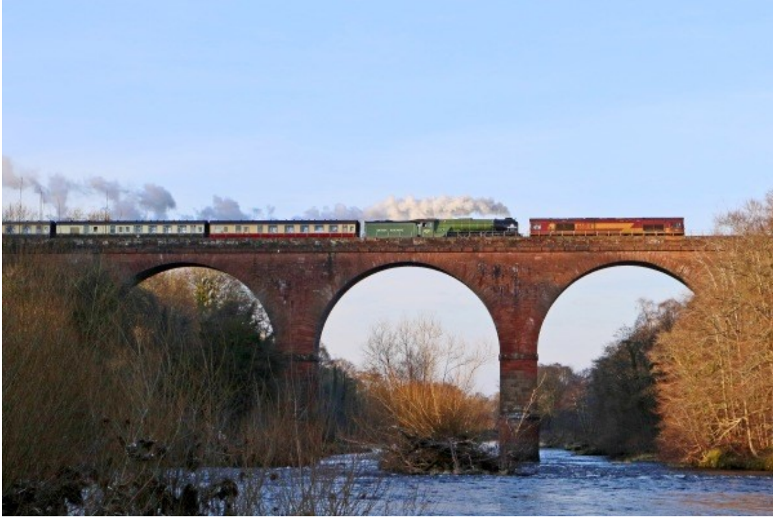
Wetheral Viaduct, another stunning location for 'The North Briton' - Neil Whitaker