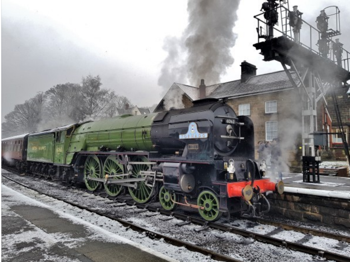
The visit to the NYMR was marked by frequent snow showers - Mandy Grant