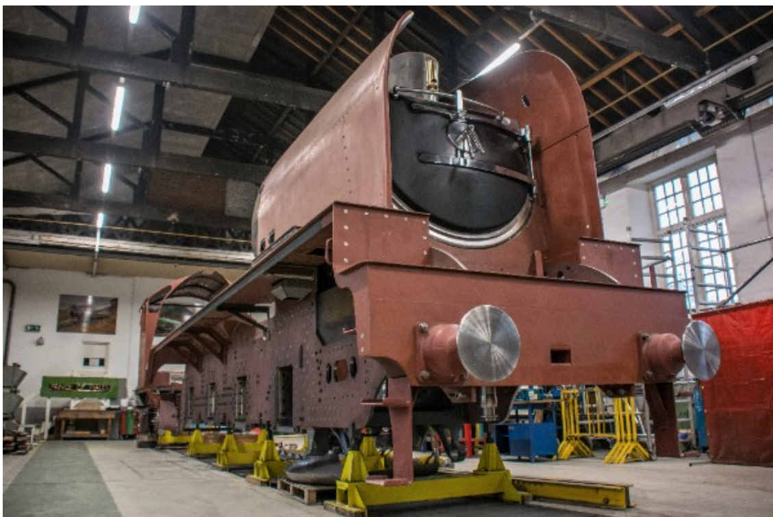
Progress on No. 2007 - Mandy Grant