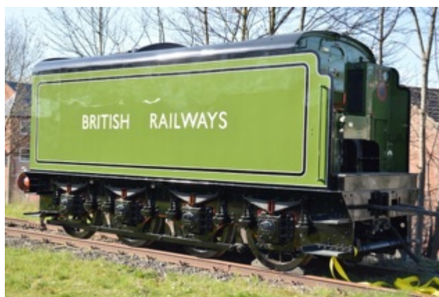
Tornado's newly re-painted tender at DLW

The last few months have seen tremendous progress in our campaign to purchase No. 60163 Tornado's tender. Membership of the extended 163 Pacifics Club has grown steadily since its launch in September 2013 and at the time of writing, 173 Pacifics of the extended 210 locomotives have already found new shed allocations, leaving only 37 remaining for sponsorship. With Tornado having attained the magic 100mph and scheduled to haul her first 90mph train, 'The Ebor Flyer', on 14 th April 2018, let's complete the project we embarked upon in 1990 through the purchase of No. 60163's tender before the start of her 10 th birthday celebrations in August 2018. Any surplus raised will be allocated to the tender's next overhaul.