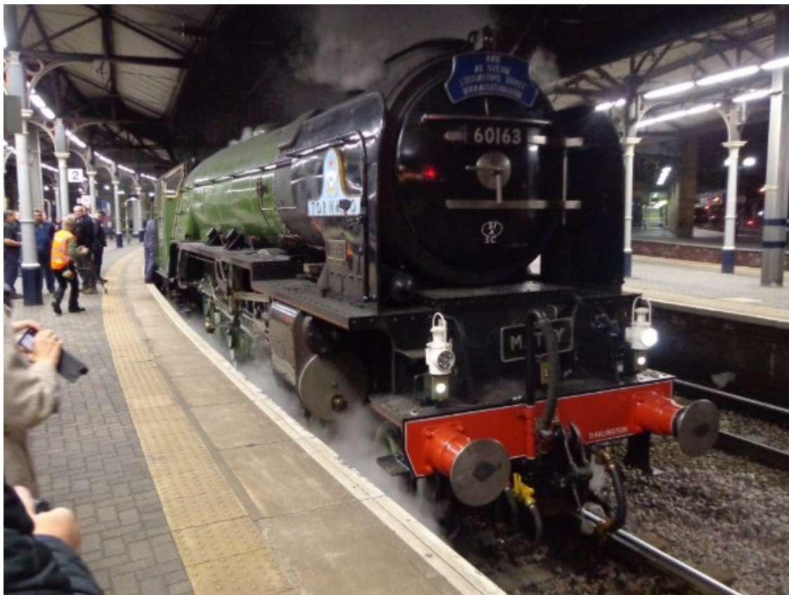
Ton-up Tornado ! No. 60163 is readied at Doncaster for a momentous night - Graham Langer