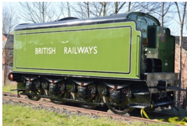
Tornado's newly re-painted tender at DLW