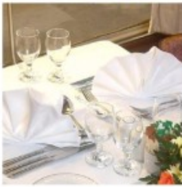
The A1 Steam Locomotive Trust 2017