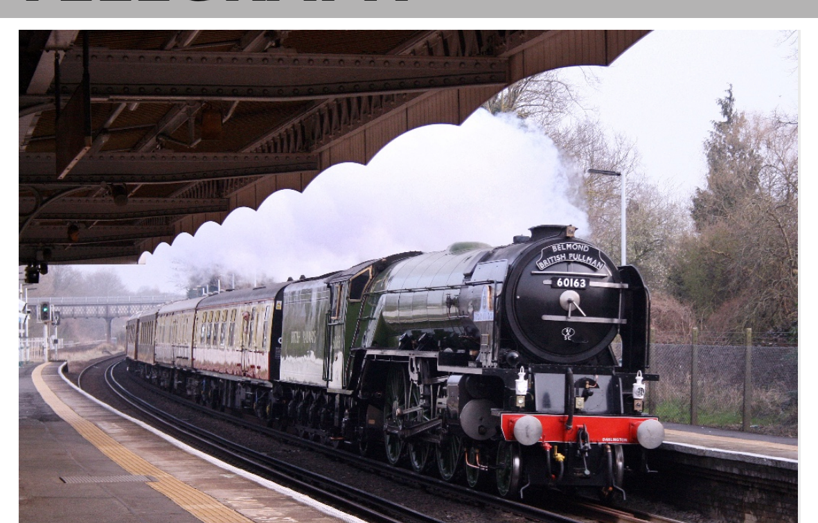
Tornado is seen at Norbury with the Belmond British Pullman on 12th March

60163 TORNADO New Steam for the Main Line