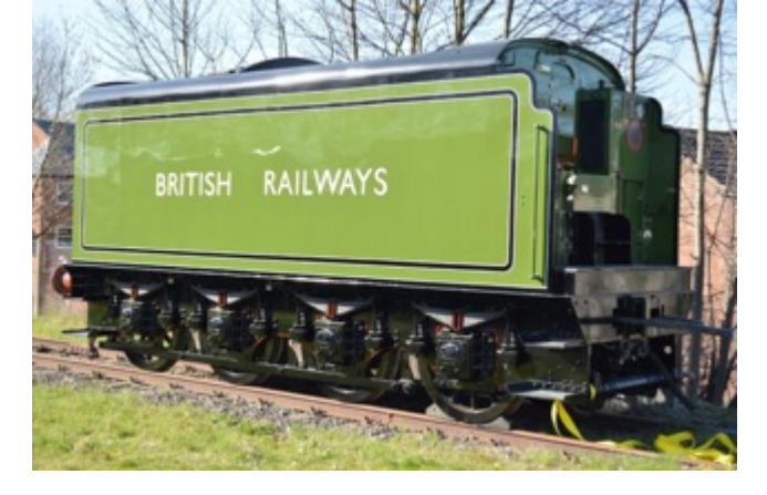
Tornado's newly re-painted tender at DLW