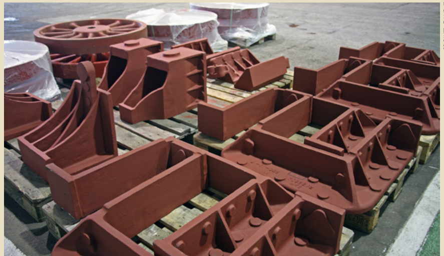
Some of the many castings for frame stays, horn guides and wheels at William Cook Cast Products.

● WORKS MANAGER - we are seeking an experienced steam locomotive engineer to join our team in Darlington in the role of Works Manager. This critical role will lead the team of staff and contractors to actually Gresley class P2 No. 2007 Prince of Wales . The successful applicant