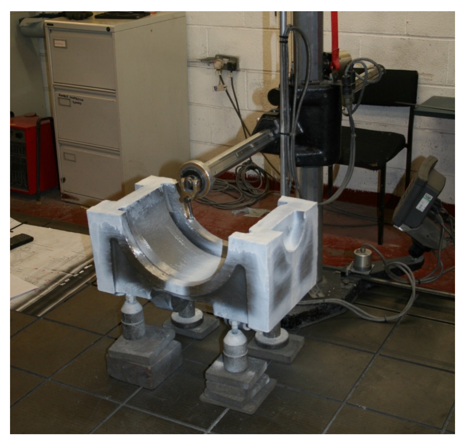
A coupled axlebox bottom casting on the measuring table at Cooks - David Elliott