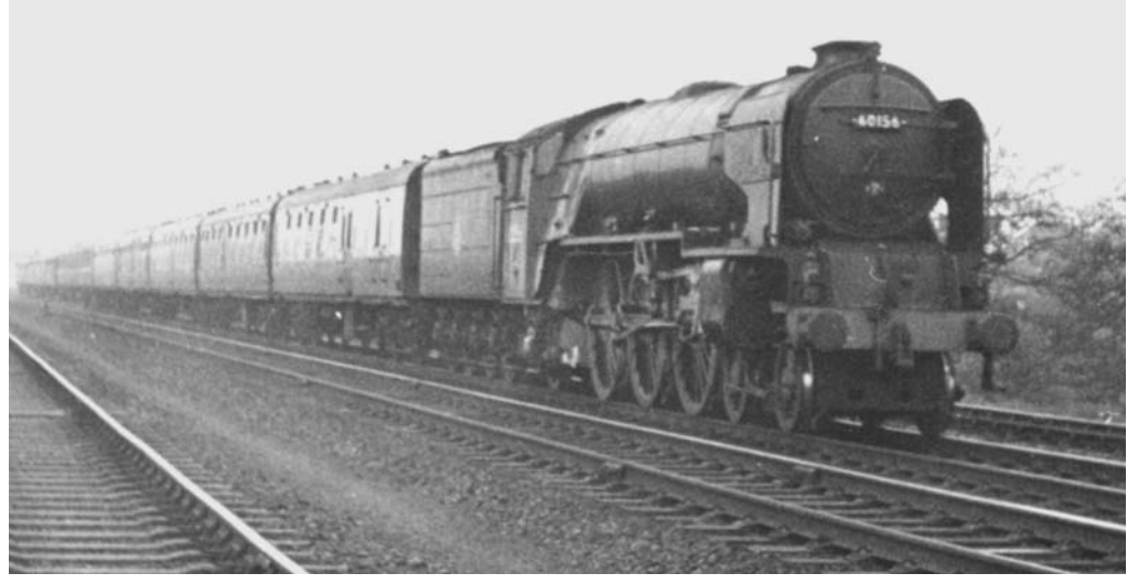
Peppercorn A1 60156 Great Central somewhere on the East Coast Main Line – in the mid-1950s, by the mixed maroon and blood-and-custard stock (photo: Geoff Chandler)

Editorial 4 Front cover, main picture: News News 5 Trial fitting of the front Bond Issue 5. 19 The big picture 14 steamchest covers (see p. 8). Tony Roche Chairman's column 16 Inset: Royalty on scheduled Website Progress? What progress? 17 trains is not new (see The Bachmann model 6, 22 The Charity Big Picture, Bequests Commissioners 19 pp. 14–15) Certificates The Safety Valve 20 (photos: David Elliott/ Engineering 23 R. G. Warwick Works 13 History Progress report 26 Steam in Dedicated Covenants 26 Wensleydale 13