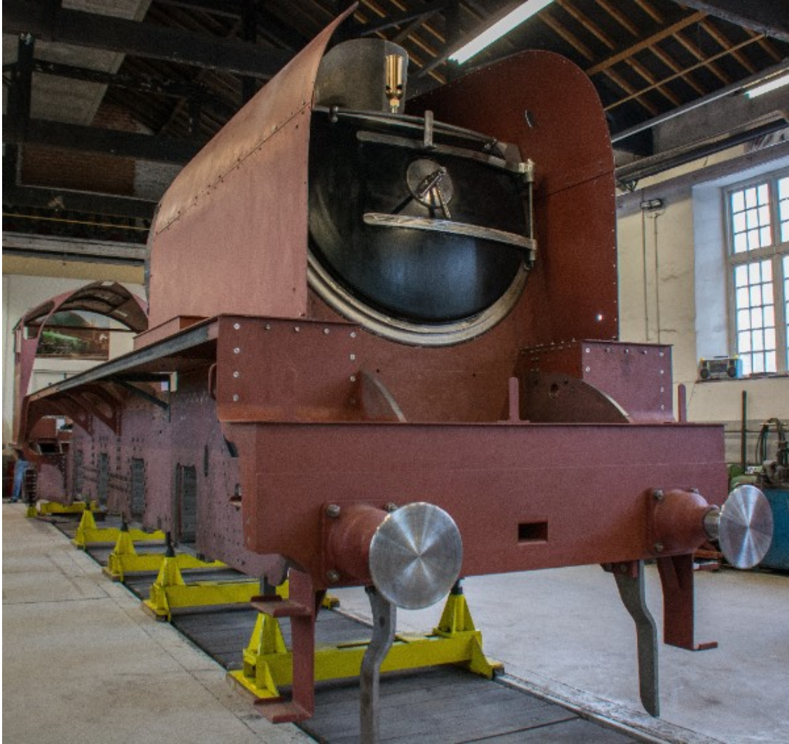
An illustration of the incredible progress made to date, No 2007 as she is now - Mandy Grant

Public interest in seeing a new Gresley class P2 become a reality sooner rather than later is high and 790 people have already signed up to the 'P2 for the price of a pint of beer per week' (£10 per month or more) covenant scheme since its launch. In addition to this core scheme, funds have been raised through The Founders Club (over 360 people have donated £1,000 each - target 100 people, now closed), The Boiler Club (well over 110 people have pledged £2,000 each - target of 300 people), The Mikado Club (105 people have pledged £1,000 each - target 160 people/£200,000), Dedicated Donations (over £180,000 from existing supporters sponsoring a variety of components) and the sponsorship of the locomotive's distinctive front-end by The Gresley Society Trust. This means that the project has already received pledges almost 50% (including Gift Aid) of the £5m needed to complete the new locomotive by 2021.