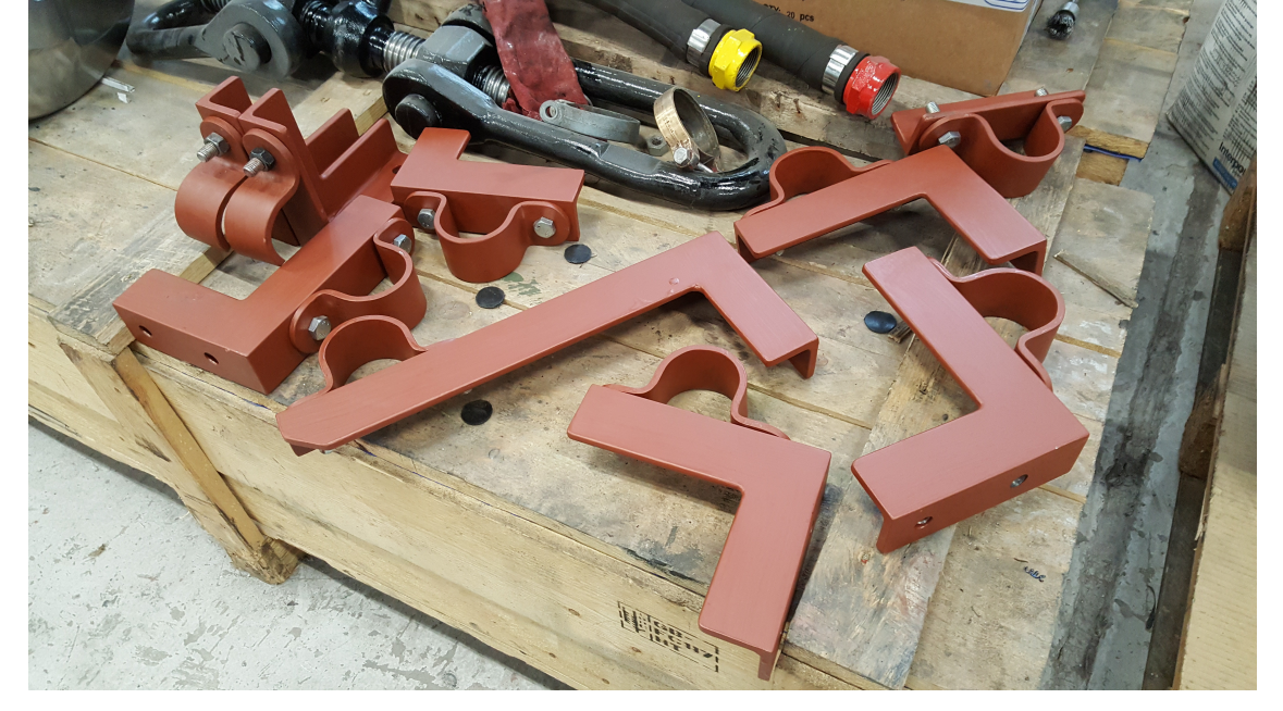
Vacuum pipe brackets

Wheel sets - Ian Matthews has been working on ensuring the leading wheelset tyres faces are gleaming with a mirror-like finish, as there was on the original P2 No. 2001 Cock of the North.