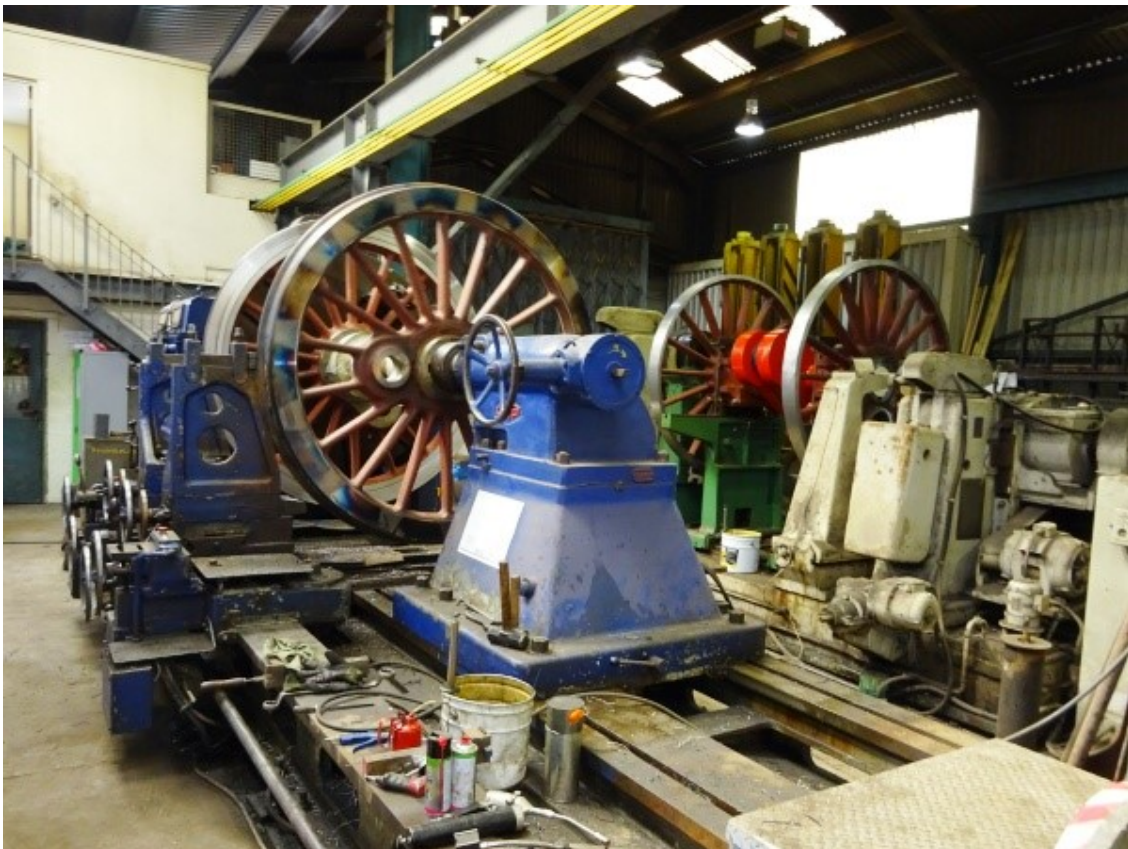
Machining back faces on the other wheel lathe and boring crank pin holes on the quartering machine - David Elliott

WHEELS TYRED - Excellent progress continues to be made with the process of wheeling and tying at SDRE. You can see the process here illustrating the steps involved in preparing the wheel centres (now all fitted to their axles) for the tyres to be shrunk on. Assembling Tornado's wheels used numerous contractors and multiple road miles so, for the Trust, having a 'one stop shop' that could do all the work has saved a lot of haulage and time.