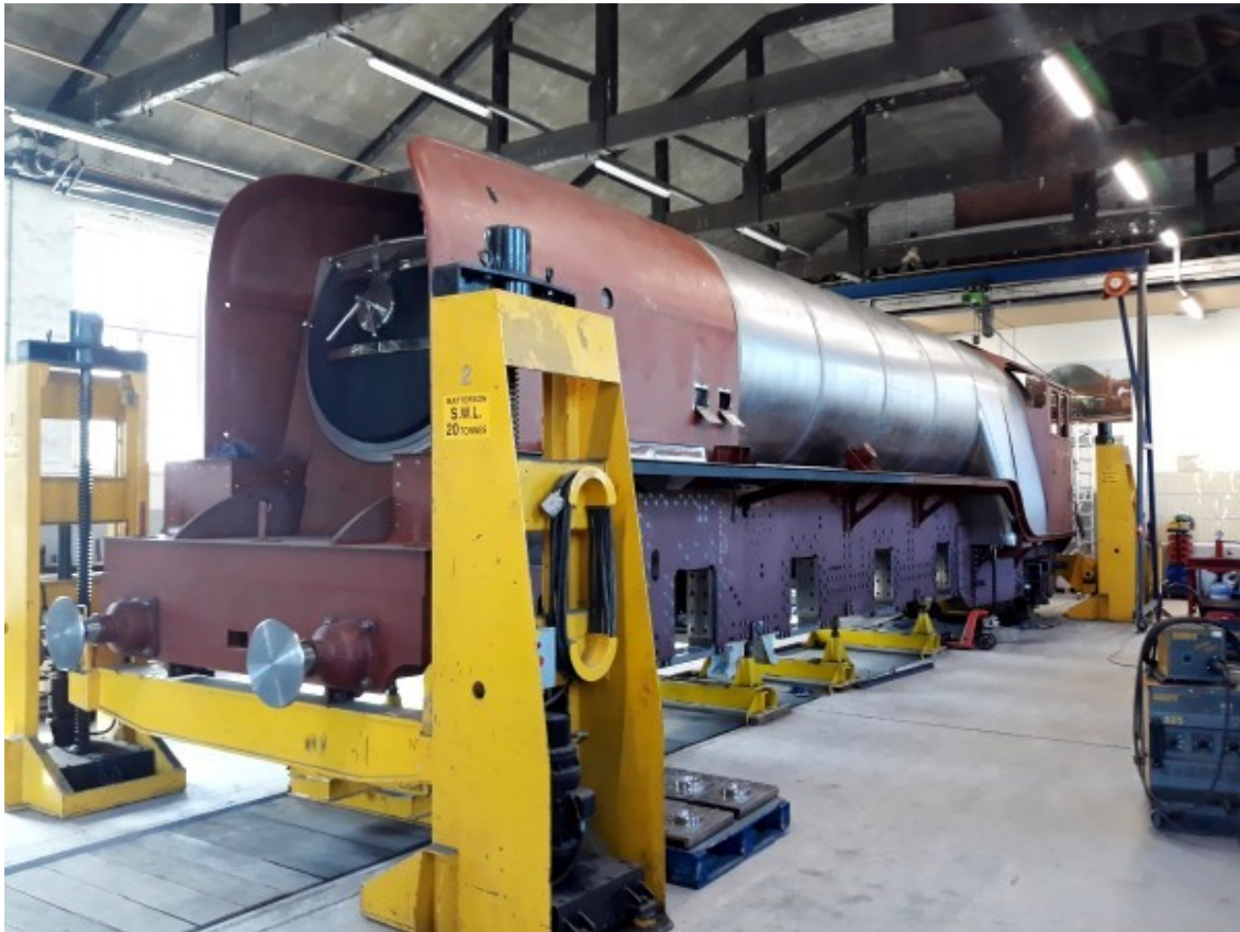
Stunning! The cladding in place on the locomotive

A flurry of activity at Darlington Locomotive Works saw the cladding completed and lifted into place on the frames. In the West Country, South Devon Railway Engineering (SDRE) have fitted the tyres to the driving wheels and started final machining of them. In other news the tender for the boiler has been issued and over ten expressions of interest have already been lodged. With the filling of The Cylinder Club and The Mikado Club, attention is now focussed of funding the larger motion parts through The Motion Club - you can find full details of how to help with this here . Donations to the project have now passed £2m - over 40% of the £5m needed to complete the locomotive - and pledges towards building the locomotive have now topped £3m.