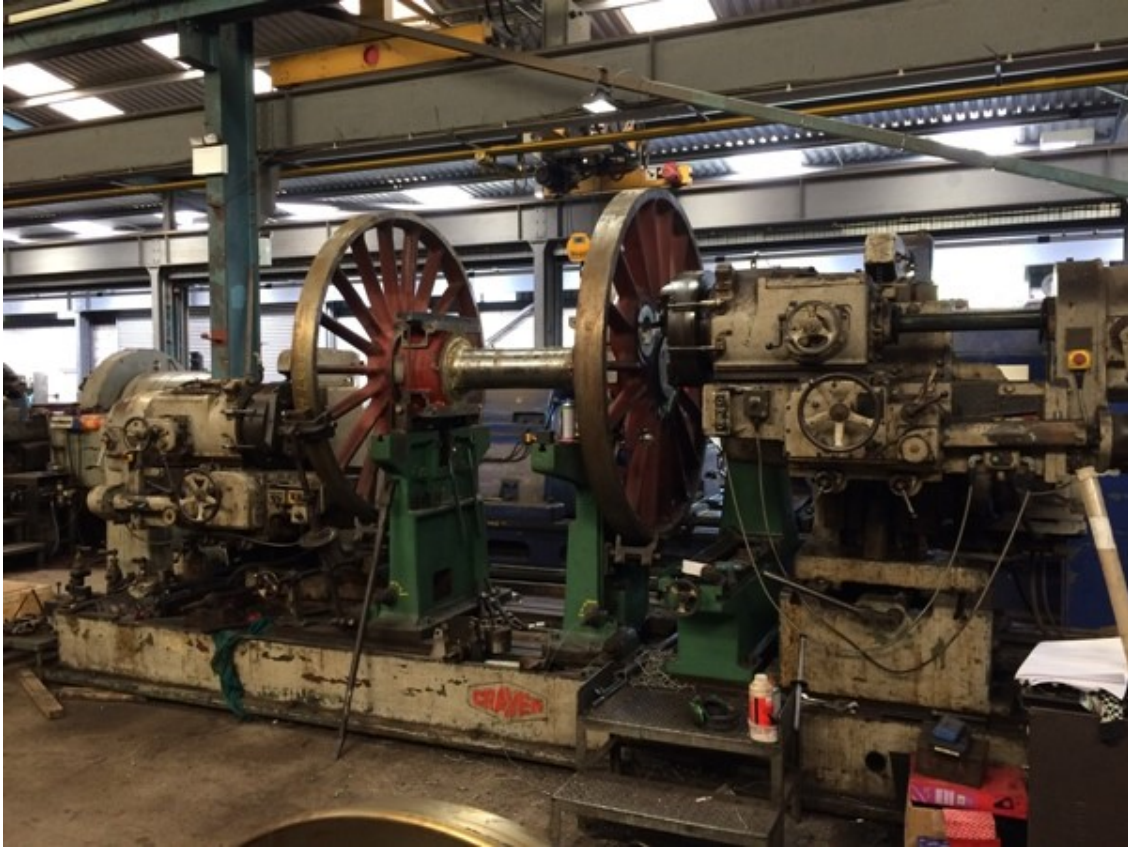
The leading coupled wheelset in the quartering machine - David Elliott

WHEELS TYRED - Excellent progress continues to be made with the process of wheeling and tying at SDRE. You can see the process here illustrating the steps involved in preparing the wheel centres (now all fitted to their axles) for the tyres to be shrunk on. Assembling Tornado's wheels used numerous contractors and multiple road miles so, for the Trust, having a 'one stop shop' that could do all the work has saved a lot of haulage and time.