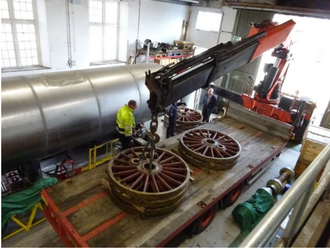
The wheels are loaded for transport to Devon - David Elliott